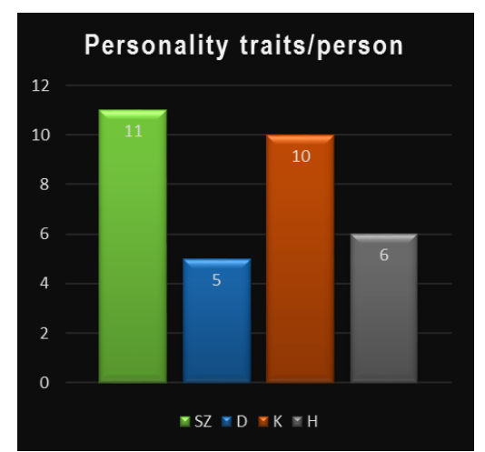
Figure 1. FR-Soft-Skills diagram summary of Research Centre of Vehicle Industry